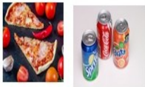
Pizza & soda available