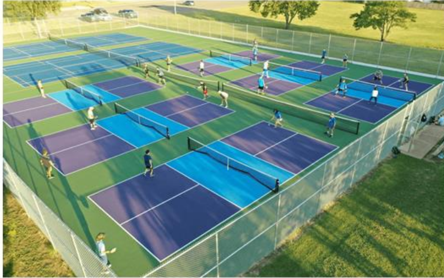
Example of court w/ net & post barrier