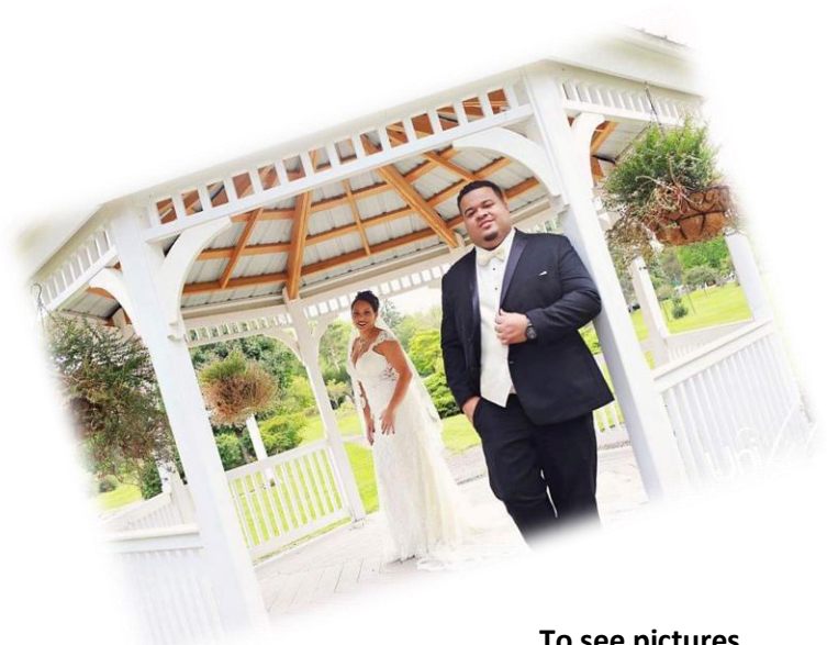
To see pictures

Botanical Gardens is made beautiful thanks in part to our friends at the NT Botanical Garden Organization, who are responsible for the plantings and flower bed maintenance. To be a part of their team email ntbgo@hotmail.com or find them on Facebook @ntbotanicalgardens.